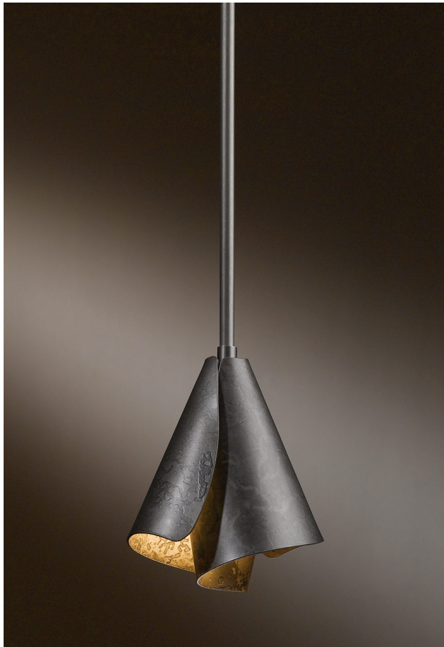
18450 MOBIUS PENDANT As shown: 18450-312-07