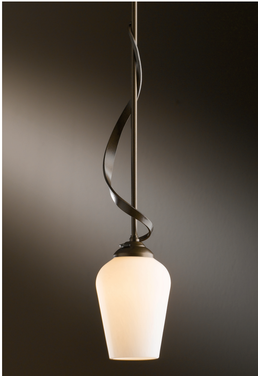
18303 FLORA PENDANT As shown: 18303-332-05-303