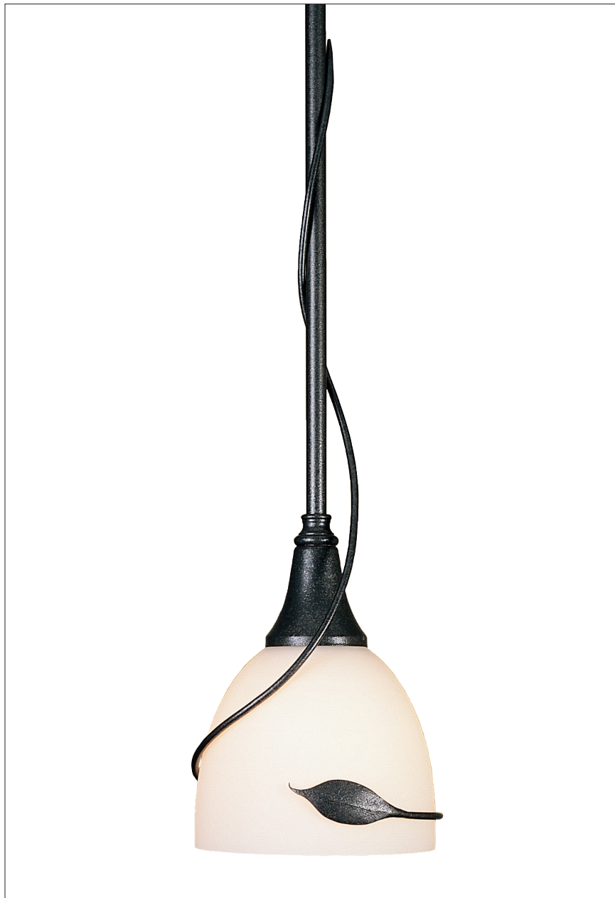
18266 TWINING LEAF As shown: 18266-301-20-G01