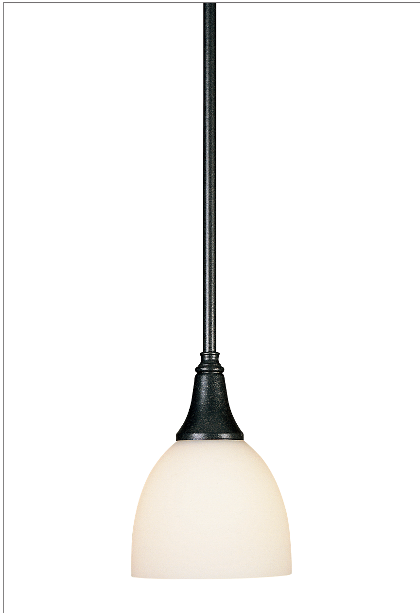
18264 TRUMPET FITTER PENDANT As shown: 18264-302-20-G01