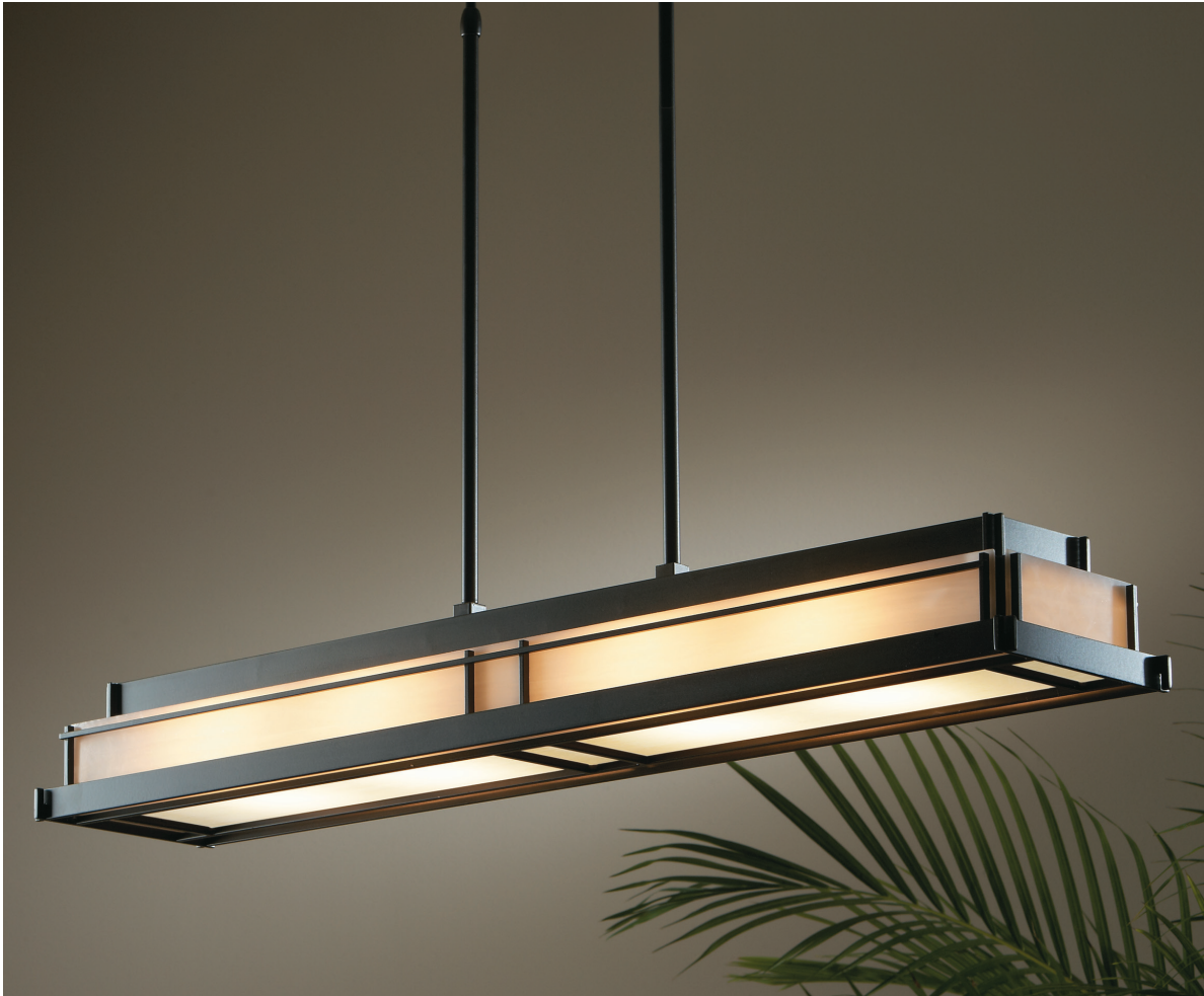
I37710 STEPPE PENDANT As shown: 137710-07-C421