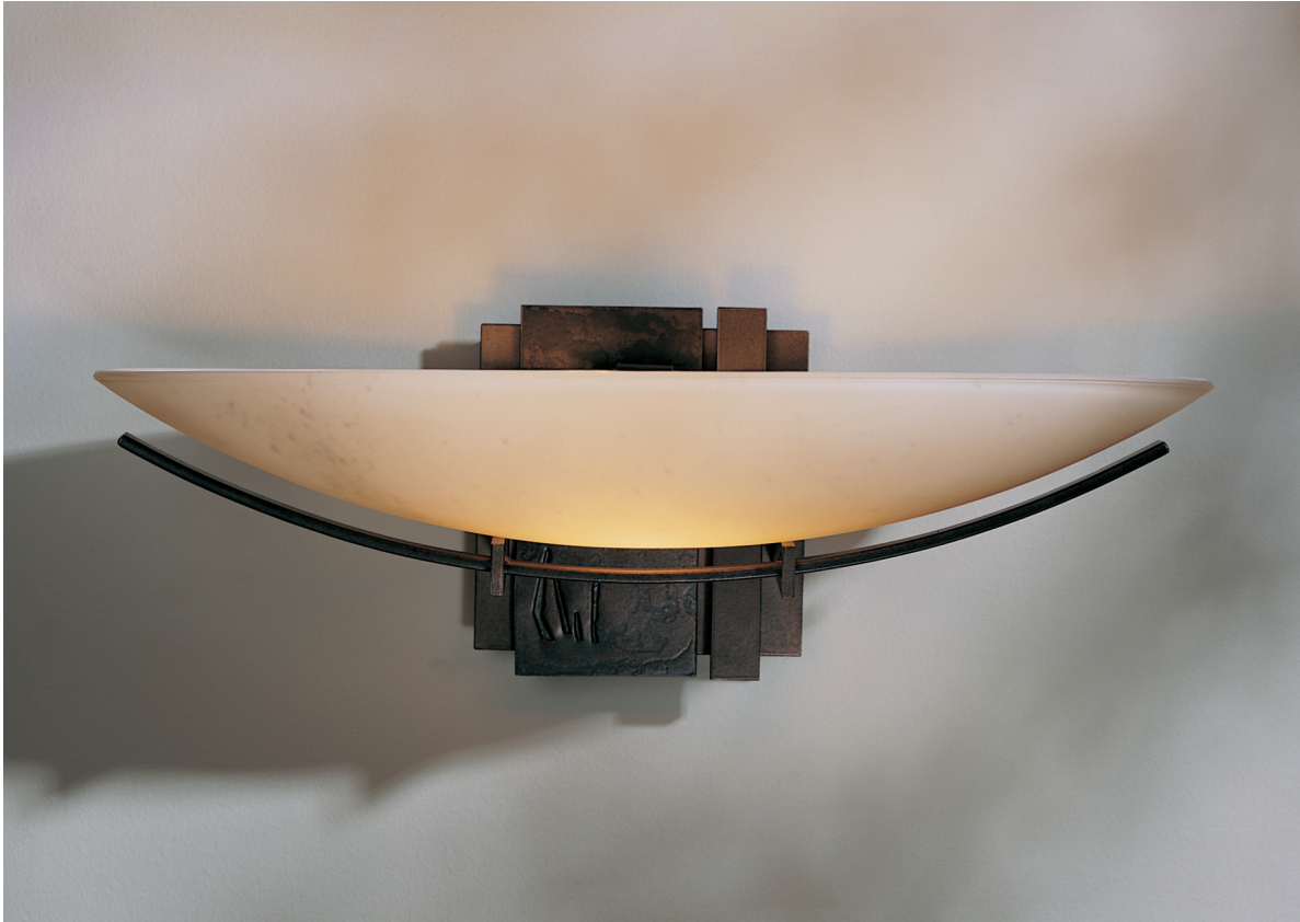
20-7370 OVAL IMPRESSIONS SCONCE