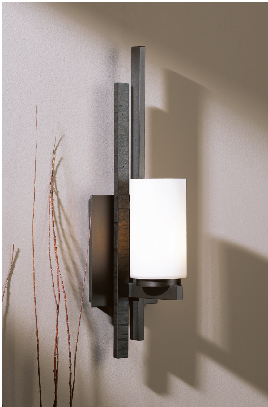
20-6301 ONDRIAN SCONCE