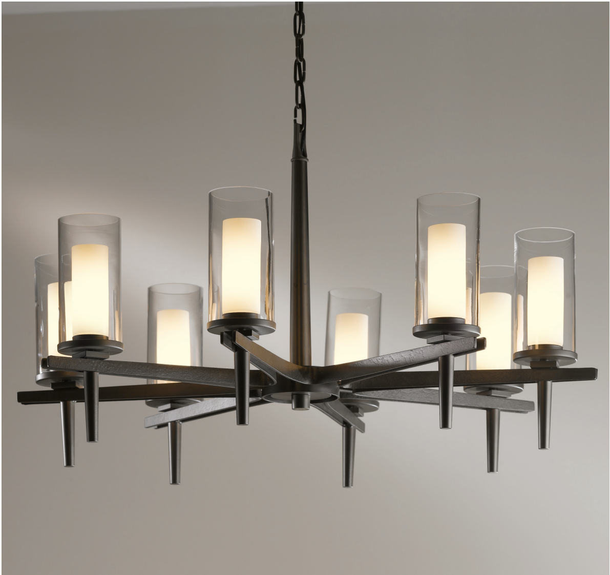
10-4305 CONSTELLATION CHANDELIER