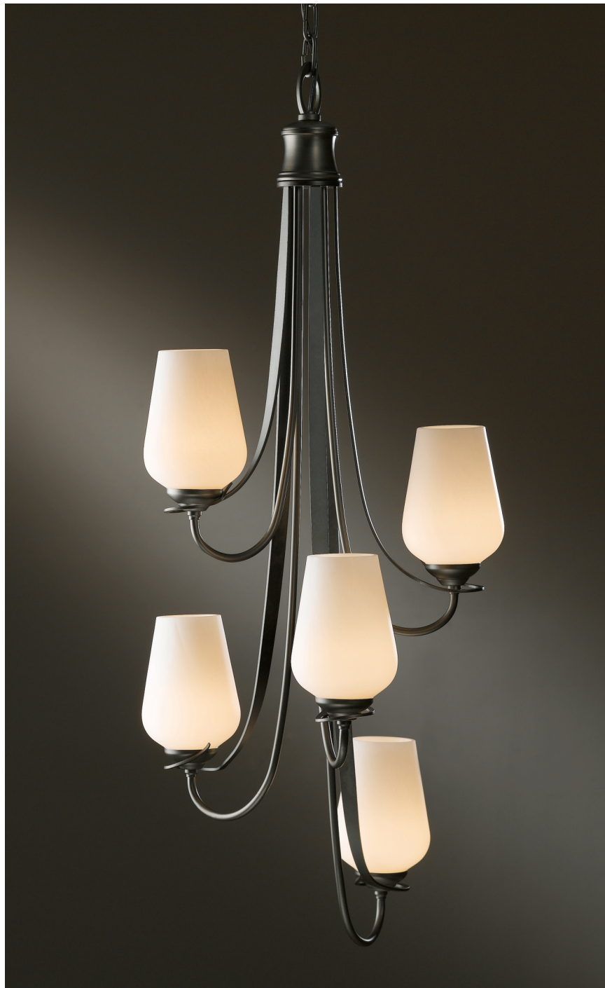
IO-3035 FLORA CHANDELIER