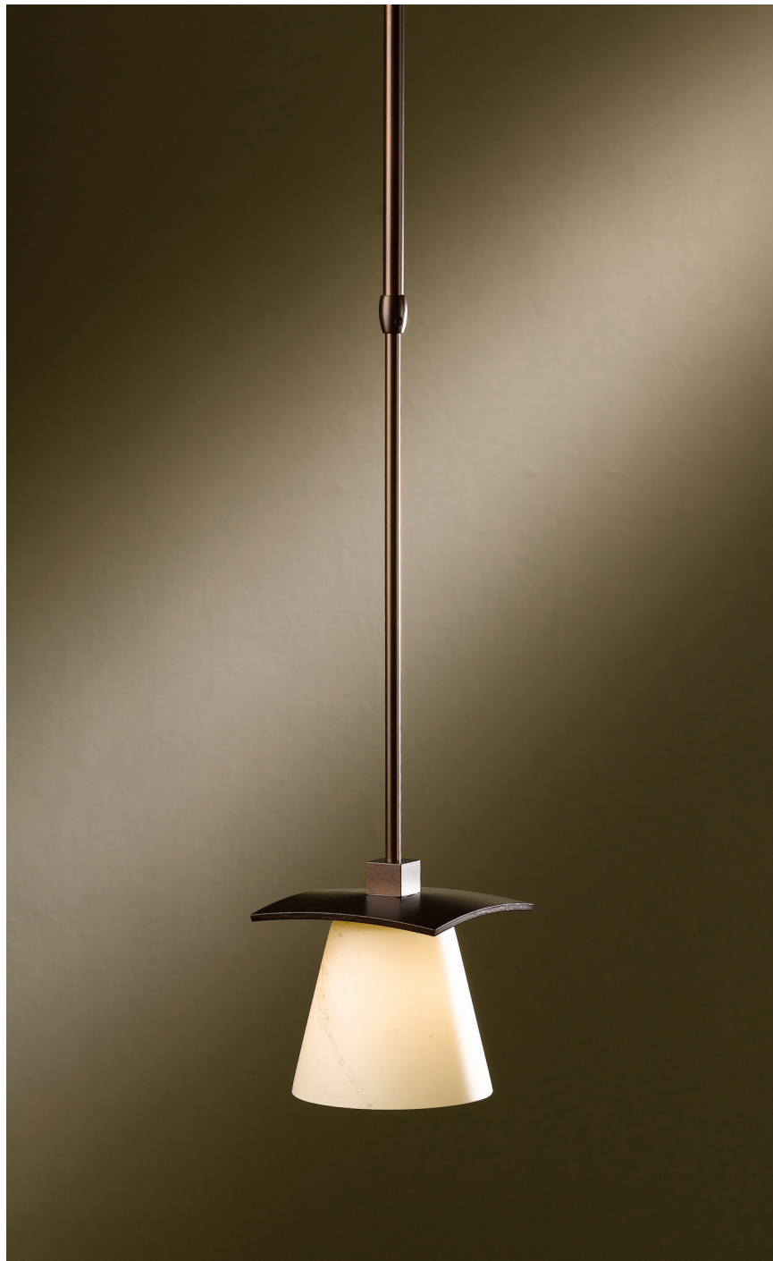
18660 WREN PENDANT As shown: 18660-312-03-H242