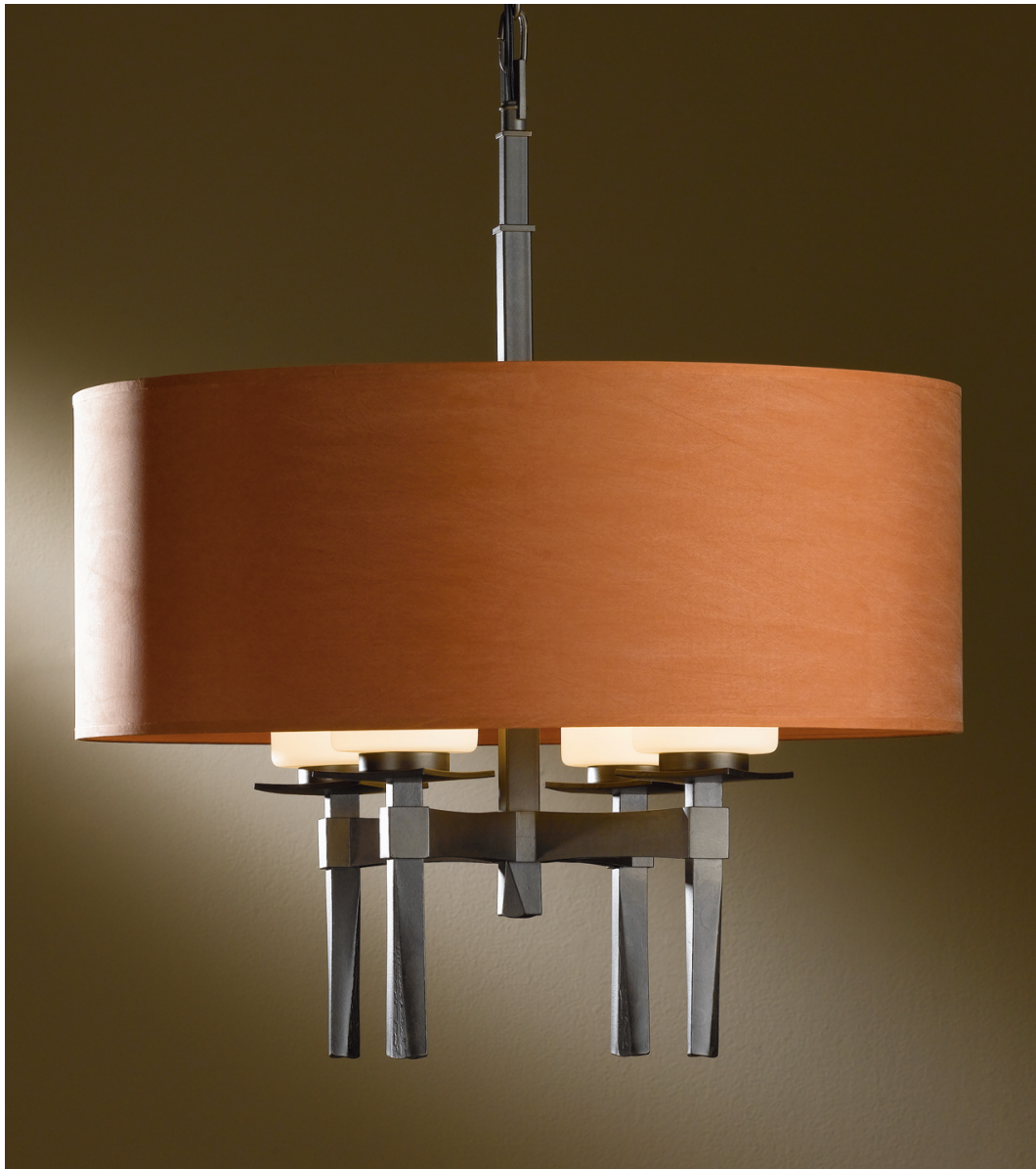
10-4815 BEACON HALL CHANDELIER